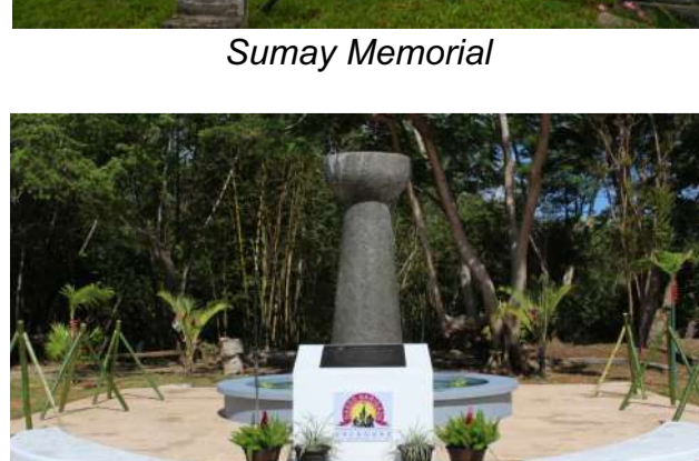
Kalaguac Memorial Barrigada